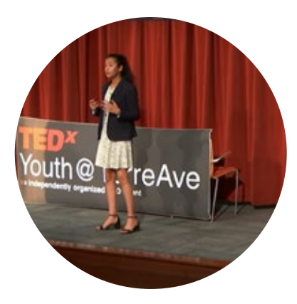
Present your business pitch to Global experts and investors